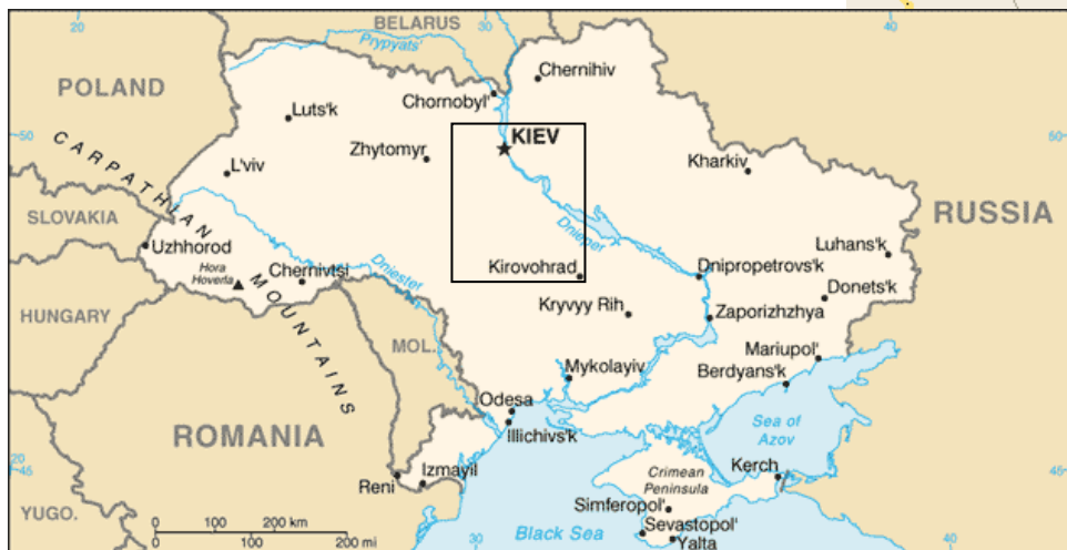
EAF study trip to Ukraine, June 2007